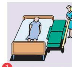
1 Place chair at bed side in horizontal position.