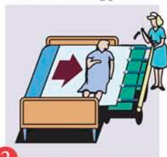
2 Attach sheet to the Barton® PTS™.