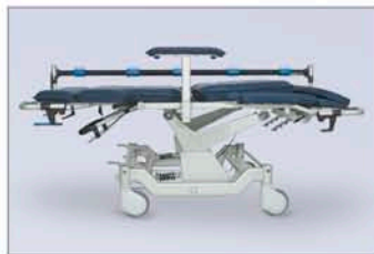
I-660 with accompanying Barton® PTS™.