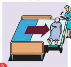
3 Transfer patient by turning handle.